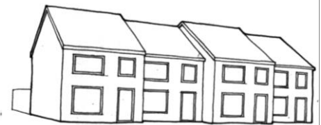
Townhouse Multiple Unit