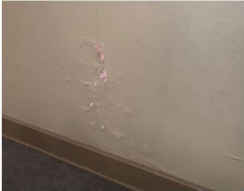
PHOTO #9 & #10: At various points in the facility, there appears to be water damage creating cracking in the plaster walls.