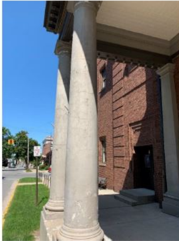
PHOTO #11 & #12: Concrete deteriorating on the columns at the entrance of the Ramsdell