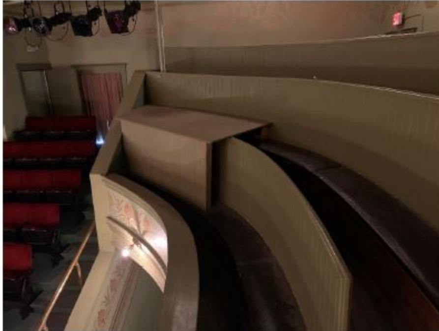
PHOTO #6: Light mounting is unsightly and is occupying space that could contain high-demand seating. Also, side lighting creates design challenges for theatrical productions.

PHOTO #5: In the upper balcony, the original benches remain. The RRCA is interested in exploring what types of seating options could be installed in these spaces to increase seating capacity and create better audience experiences.