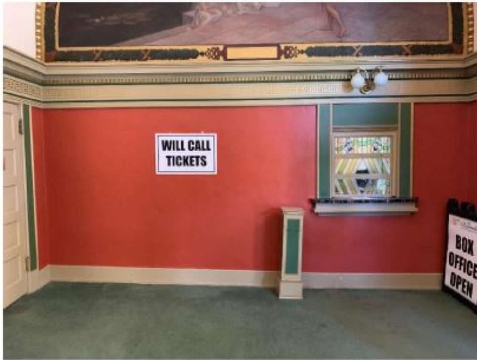
PHOTO #14: Interior of ticket booth. There is limited space for ticket booth workers.

PHOTO #13: Exterior of ticket window. There is space to add at least one additional ticket window.