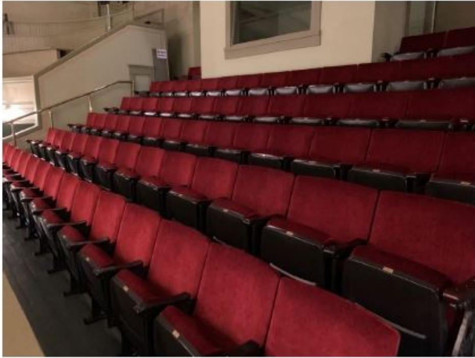
PHOTO #4: The side of the 2 nd floor balcony contains the original seating. This was completed to honor the history of the facility. At the time, it was thought that the seating capacity of the theatre was sufficient, so a section could be dedicated to historic seating. However, with the success of new programming, seating capacity is a growing issue.

PHOTO #3: Seating in the 2 nd floor balcony has very tight leg room, limiting ticket sales in these seats due to audience members being uncomfortable.